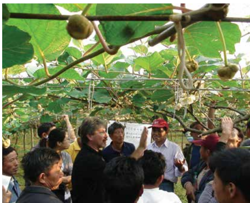
Field visit to vegetable greenhouse