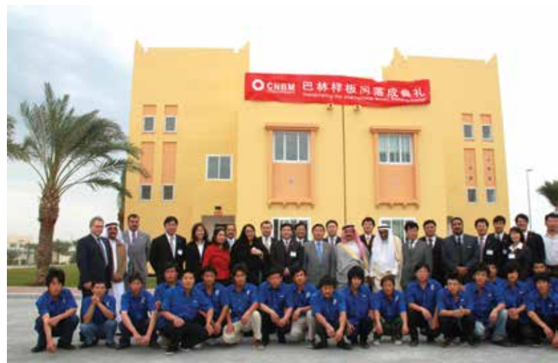
Building Efficiency and Research and Development of Energy Efficient Walling Systems