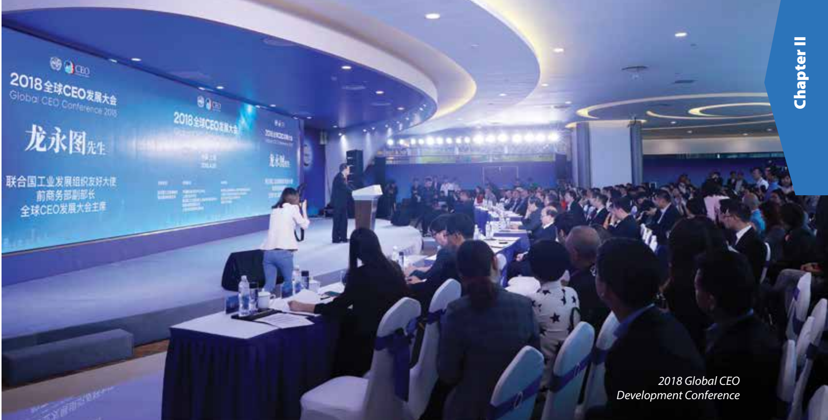
2018 Global CEO Development Conference