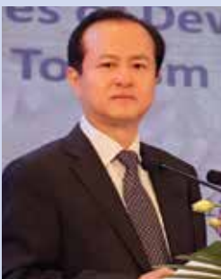
Yan Dong Director General China International Center for Economic and Technical Exchanges (CICETE)

Through their shared endeavour of promoting South-South cooperation, CICETE will, as always, further deepen its strategic partnership with UNOSSC and serve as a bridge between China and the rest of the world.