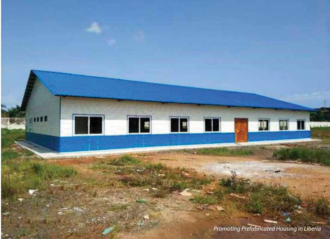
Promoting Prefabricated Housing in Liberia

Technology Co., Ltd. and the Ministry of State for Presidential Affairs of Liberia collaborated on this project to promote and transfer prefab housing technology from China to Liberia, build local capacity and improve local housing standards. The project achieved this through: