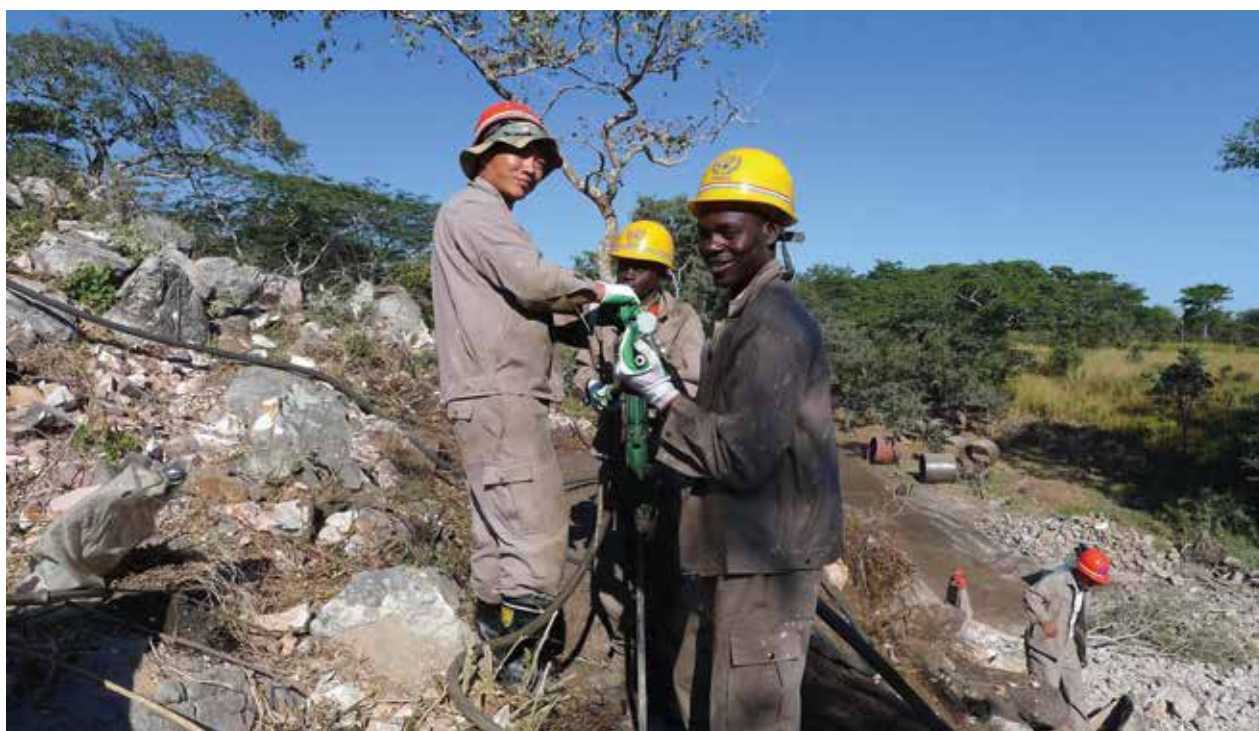
Shiwang'andu Small Hydro Power Project