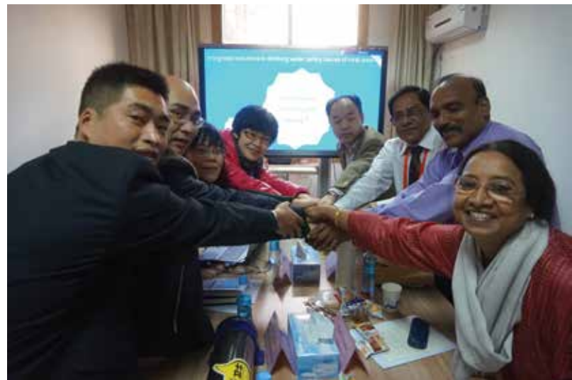
Integrated solutions to drinking water safety issues of rural area in Sri Lanka

than 140 countries and international organizations. BRI provides new opportunities and impetus for international collaboration, including South-South cooperation and triangular cooperation. Institutions and mechanisms such as the China International Development Cooperation Agency (CIDCA), the Silk Road Fund, the South-South Cooperation Assistance Fund and the China Centre for International Knowledge on Development (CIKD) have also been newly established to further promote cooperation between China and other countries of the South.