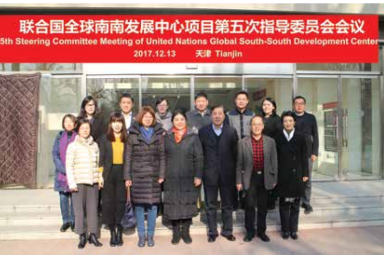
The 5th Steering Committee Meeting of the SSDC Project took place in Tianjin China, December 2017.