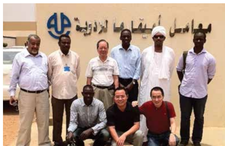
Technical Cooperation for Environmentally Friendly Pesticide Formulation in Sudan