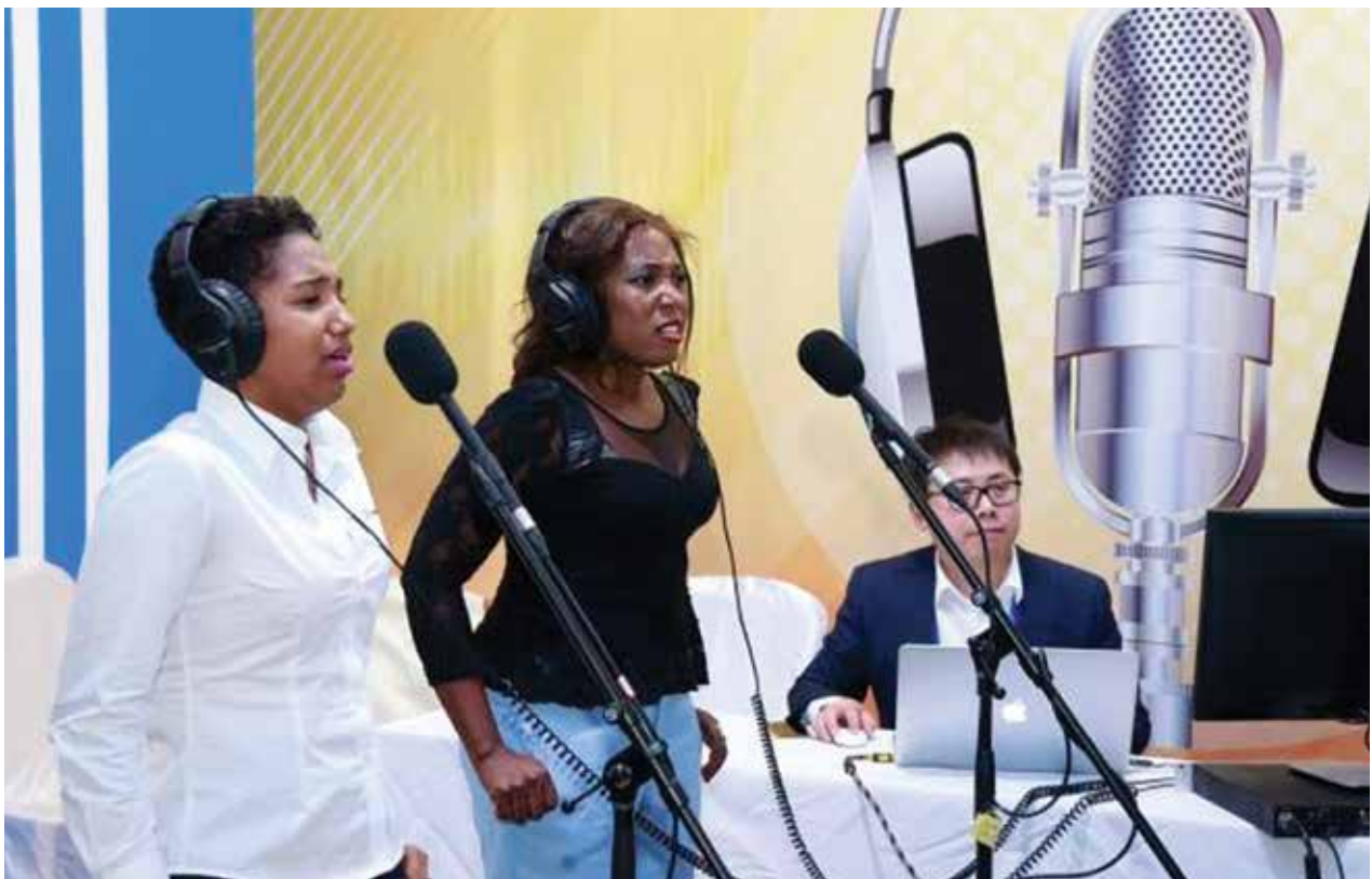
Performance at the "Seventh African Digital Television Development Forum"