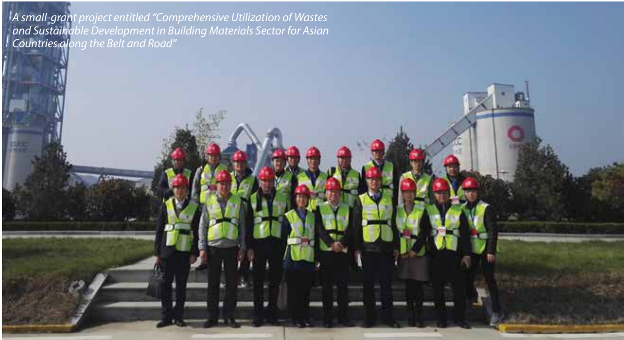
A small-grant project entitled "Comprehensive Utilization of Wastes and Sustainable Development in Building Materials Sector for Asian Countries along the Belt and Road"

time, the Government of Viet Nam has published a series of new policies to encourage the development of building materials. Thus, heat-insulation walling-material technology is crucial to the growth of the building sector of Viet Nam.