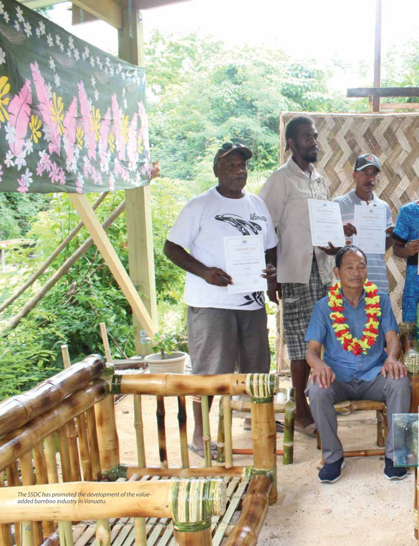
The SSSC has promoted the development of the value-added bamboo industry in Vanuatu.