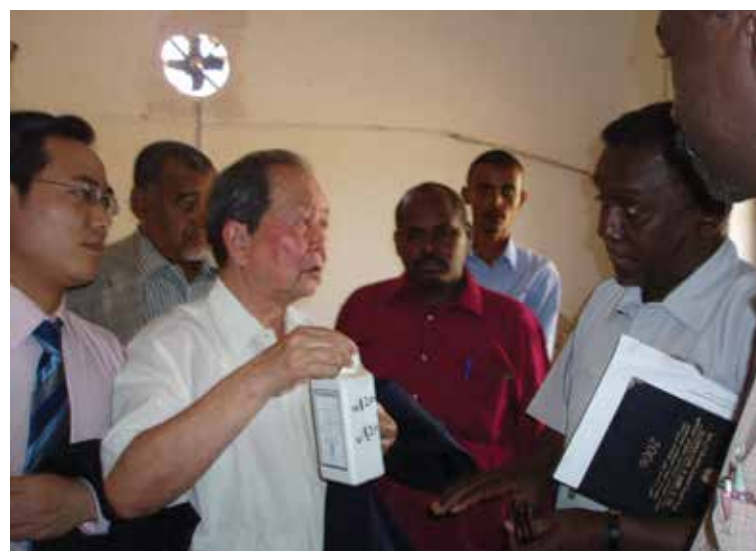
Technical Cooperation for Environmentally Friendly Pesticide Formulation in South Africa