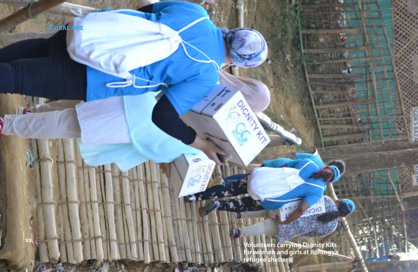
Volunteers carrying Dignity Kits for women and girls at Rohingya refugee shelters

As part of its efforts to support and restore dignity to women, Global One has distributed essential hygiene items to women living in difficult conditions through its Dignity Kits campaign. Dignity lies in the smallest of things – a toothbrush, sanitary pads or even nail clippers. These kits consist of everything that is needed by a woman to be able to healthily and safely manage her period in a sanitary, hygienic and dignified manner, thereby improving her physical and emotional well-being.