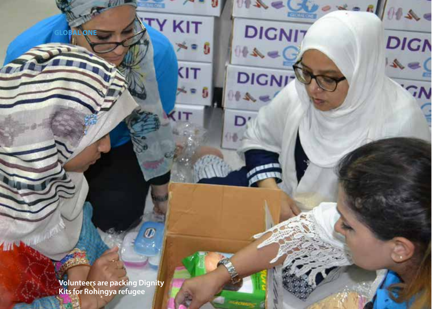
Volunteers are packing Dignity Kits for Rohingya refugee