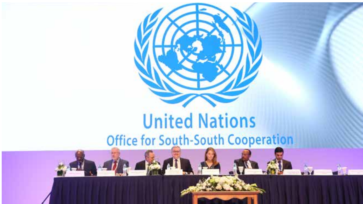
Prominent dignitaries attending the High-level Opening Ceremony.