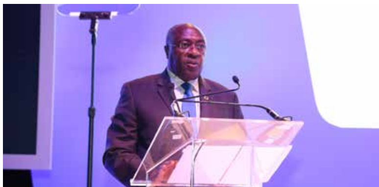
H.E. Ambassador Richard Nduhuura, Permanent Representative of the Republic of Uganda to the United Nations and President of the High-level Committee on South-South Cooperation, addressed at the High-level Opening Ceremony.

H.E. Ambassador Richard Nduhuura, Permanent Representative of the Republic of Uganda to the United Nations and President of the High-level Committee on South-South Cooperation , emphasized that the pivotal role of South-South cooperation has recently been emphasized not only in the context of the 2030 Agenda, but also of the Sendai Framework for Disaster Risk Reduction 2015-2030, the Addis Ababa Action Agenda of the Third International Conference on Financing for Development and the Paris Agreement under the United Nations Framework Convention on Climate Change.