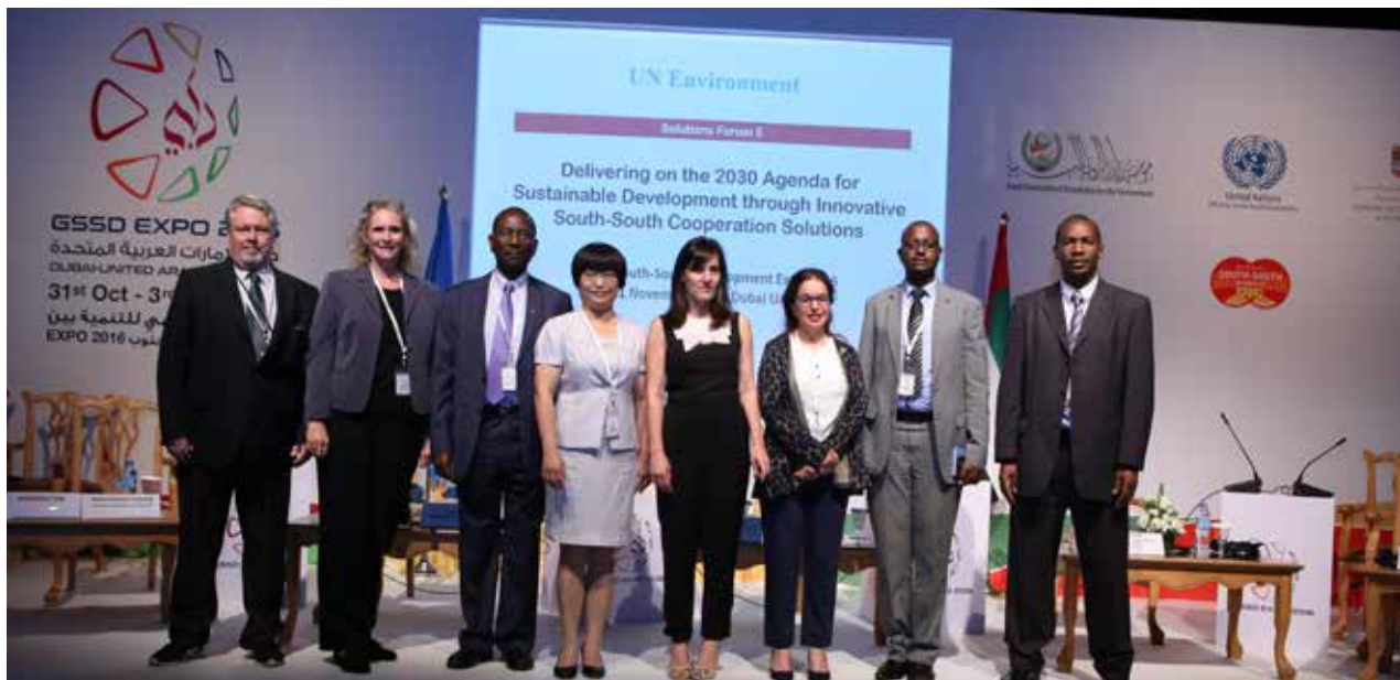
Solution Forum 5 panel discussed innovative approaches towards environmental, social and economic development.

The UNEP Solution Forum discussed different approaches from the South to advance a balanced integration of the environmental, social and economic dimensions of development in line with the 2030 Agenda. It showcased the following solutions: