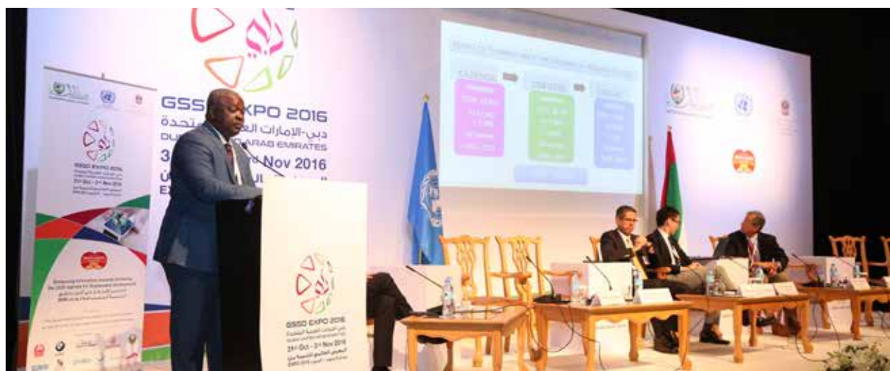
Solution Forum 12 panel discussed international cooperation on skills development, education and training

Brazil's National Service for Industrial Training (SENAI) coordinated the Solution Forum and discussed effective solutions from institutions that contribute to achieving the UN's sustainable development goals.