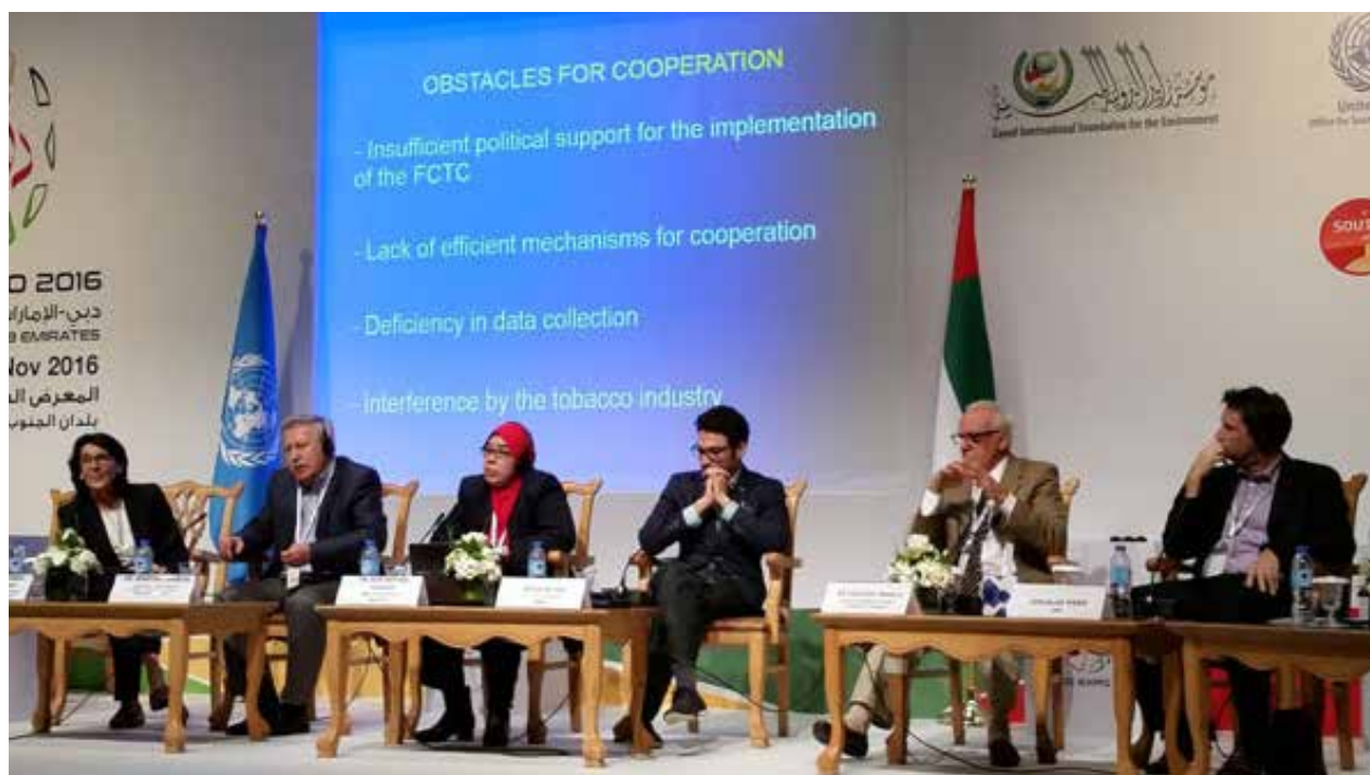
The Solution Forum 13 discussed the results of joint efforts by UNDP and the WHO Framework Convention on Tobacco Control Secretariat to promote SSC and TC for tobacco control.

The WHO Framework Convention on Tobacco Control (FCTC), an international and legally binding treaty with 180 parties as of September 2016, is the world's main tool to combat tobacco use and its consequences. The Solution Forum presented results from joint efforts of UNDP and the WHO FCTC Secretariat to promote South-South and triangular cooperation for tobacco