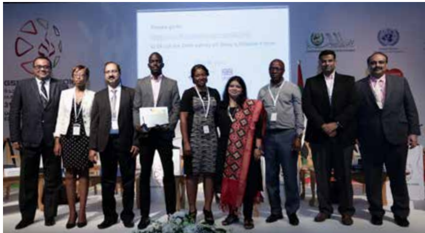
Solution Forum 4 panel discussed the role of trade and investment in supporting countries from the global South.

This Solution Forum emphasized the role of trade and investment in assisting countries from the global South achieve sustainable development. The UN system, through entities such as ITC, can help to facilitate South-South trade. This includes actions such as assisting with the development of relevant government policies, regulations and infrastructure; supporting SMEs; helping to ensure that populations in the global South have the right skills, experience and training; facilitating access to financing; and, identifying and bringing together buyers and sellers. The forum emphasized the importance of making available appropriate technology, as called for in the 2030 Agenda and the Addis Ababa Action Agenda.