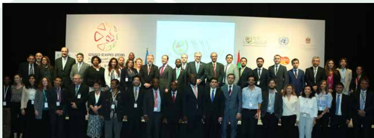
DG Forum participants.

Co-organized by the United Nations Office for South-South Cooperation and the Japan International Cooperation Agency