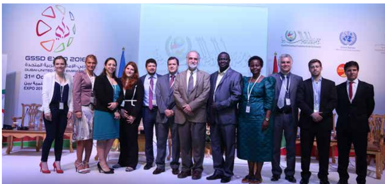
Solution Forum 14 panel.

The Agricultural Innovation MKTPlace is an international initiative backed by multiple partners with the aim of connecting Brazilian, African, Latin American and Caribbean specialists and institutions to jointly develop agricultural development research projects. The aim is to promote knowledge exchange among African, Brazilian and Latin American and Caribbean countries and: