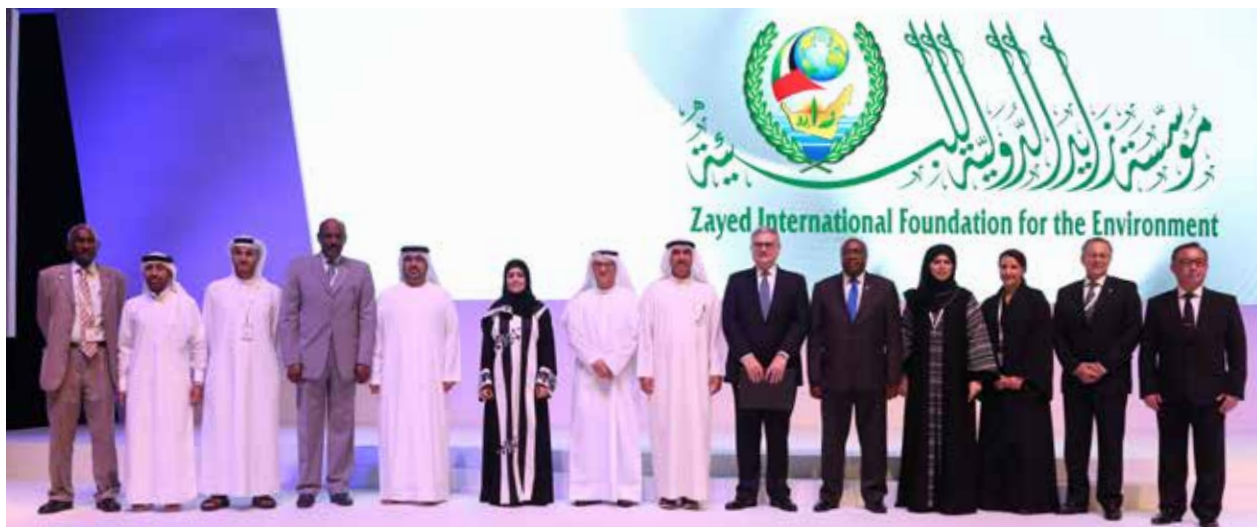
High Level Closing Ceremony of the GSSD Expo 2016