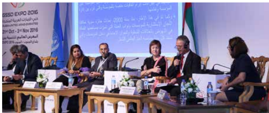
Solution Forum 1 panel.

The Forum focused on the thematic topic, the “Future of Work”. It showcased practical examples of how Southern practices and South-South cooperation can help positively shape policies and programmes that advance social justice and inclusion in the labour market. Two examples shared during the solution forum were: