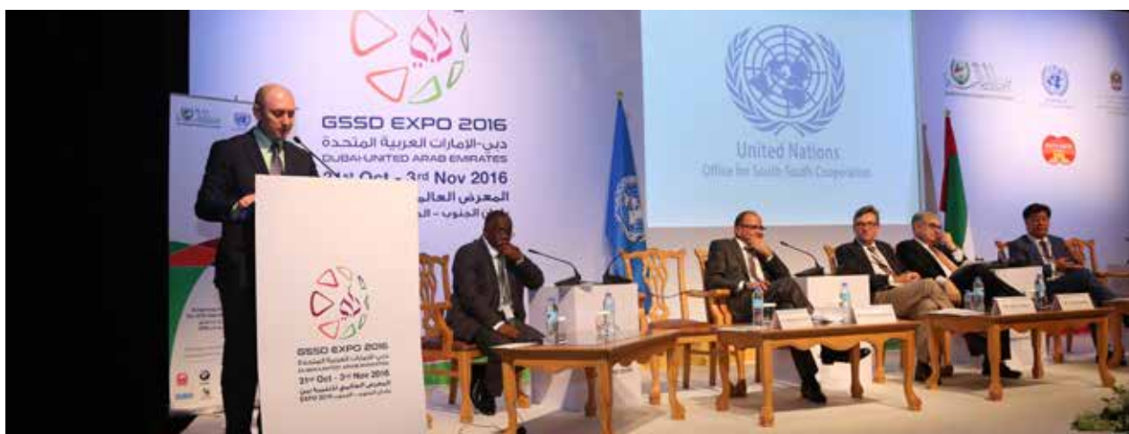
Solution Forum 10 panel.

Cooperation among Southern countries has grown significantly in the last decade. It has often taken the form of private investment, knowledge sharing, or concessions on market access. Some developing countries have offered preferential treatment to LDCs' products. This trend towards South-South cooperation is likely to continue, with the share of traditional DAC ODA declining as a proportion of all flows to developing countries.