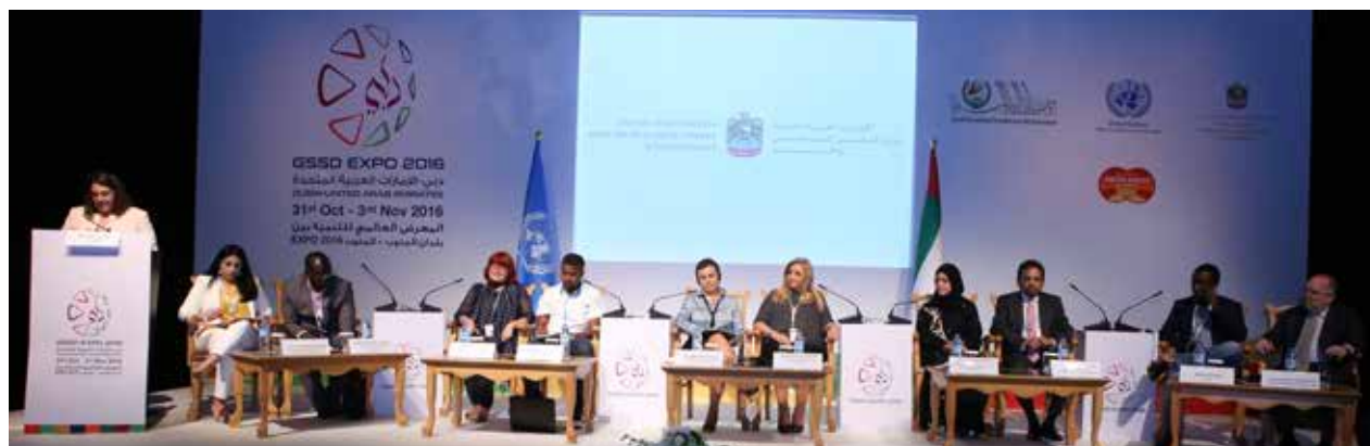
Solution Forum 6 panel.

During this Solution Forum, UNFPA created a policy dialogue with Member States and other partners on the basis of concrete responses that are comprehensive and strategic with regard to the demographic dividend and youth. The Solution Forum served as a space for sharing experiences as well as national and subnational policies, strategies and services that can then be shared through South-South and triangular cooperation to reap the demographic dividend, including: