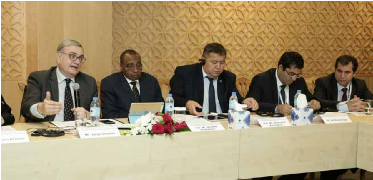
Participants discuss South-South and Triangular cooperation for agricultural development solutions

The meeting discussed practical ways to promote successful home-grown solutions and the national expertise of the participating countries in the thematic areas supported by the SSTC-ADFS initiative, including management of farmer-based organizations, effective water resources management, agricultural biotechnology, livestock and horticulture development.