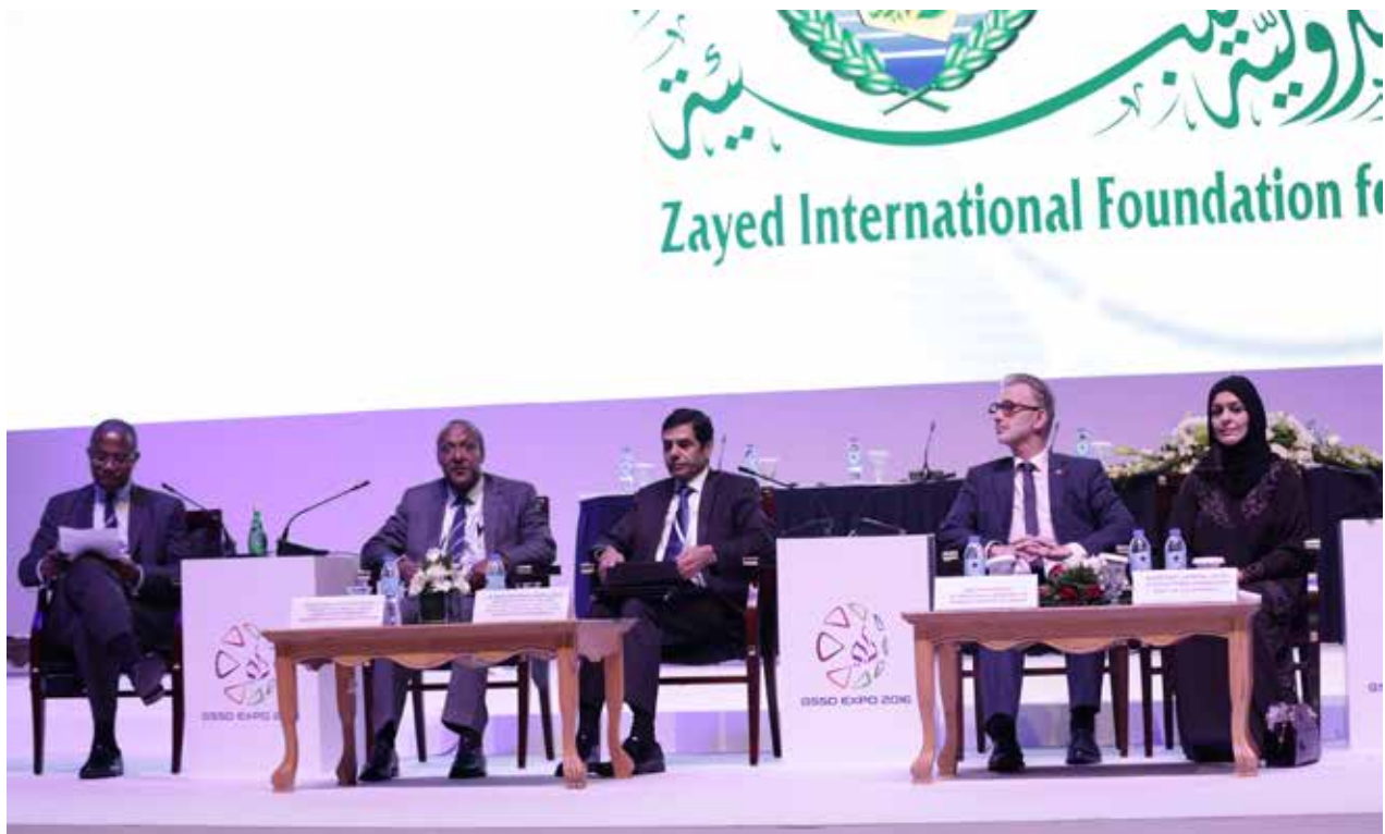
Participants from the Plenary Session 1 discuss how to have stronger partnerships for Climate Action and Sustainable Development

Plenary Session 1: Partnerships for Climate Action and Sustainable Development: Sharing Experiences in South-South and Triangular Cooperation (Coordinator: Executive Office of the United Nations Secretary-General, UNOSSC and Zayed International Foundation for the Environment)