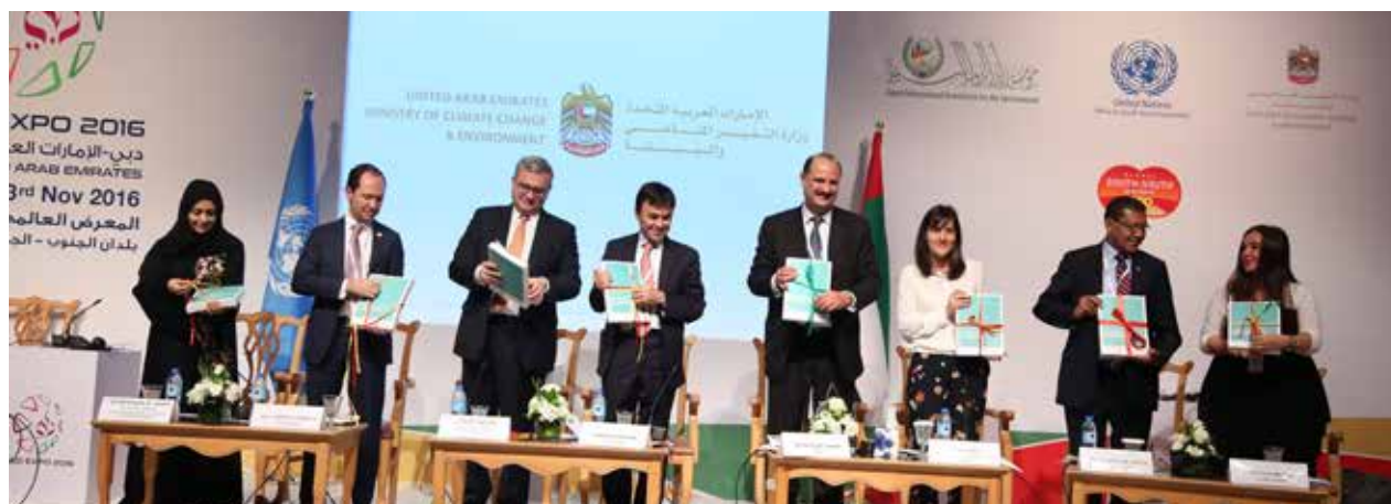
Solution Forum 15 panel members launched report.

The space and opportunities for the use of South-South and triangular cooperation in the areas of peace and development, crisis prevention, conflict management and peacebuilding are growing. In 2015, the Government of Colombia, through its Presidential Agency of International Cooperation (APC Colombia), and UNOSSC embarked upon a new strategic initiative for the post-2015 development agenda, particularly SDG 16, promoting peaceful and inclusive societies for sustainable development, providing access to justice for all and building effective, accountable and inclusive institutions at all levels.