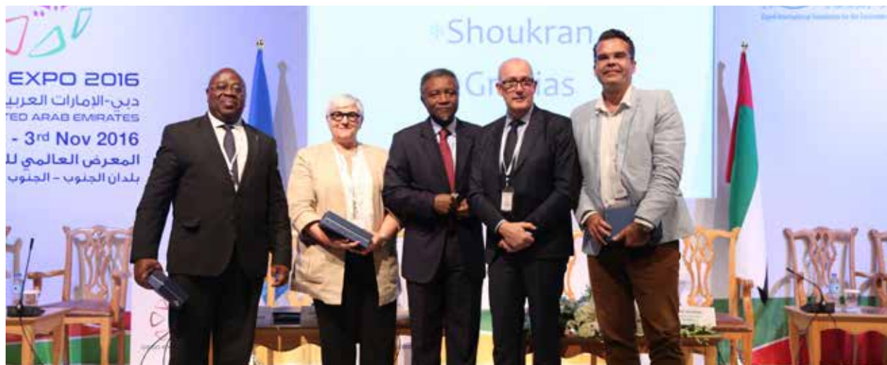
Solution Forum 16 panel

The employment and socio-economic inclusion of young people has become a major concern for Togo and has been featured prominently in the National Development Policy document, “Strategy for Accelerated Growth and for Promotion of Employment 2013-2017.”