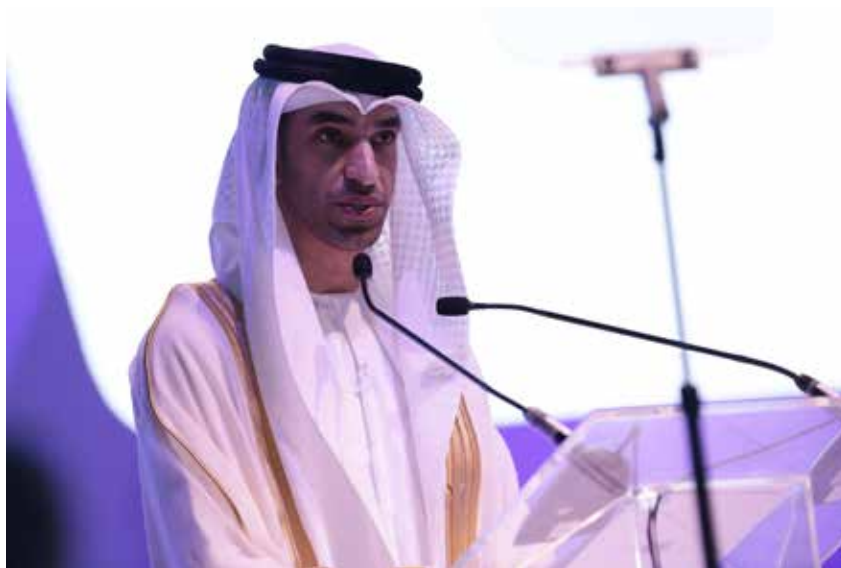
H.E. Dr. Thani Ahmed Al Zeyoudi, Minister of Climate Change and Environment, Government of the United Arab Emirates

H.E. Dr. Thani Ahmed Al Zeyoudi, Minister of Climate Change and Environment, Government of the United Arab Emirates , opened the session with greetings to His Highness Sheikh Maktoum bin Mohammed bin Rashid Al Maktoum, Deputy Ruler of Dubai, and welcomed the participants to the Eighth Session of the Global South-South Development Expo 2016.