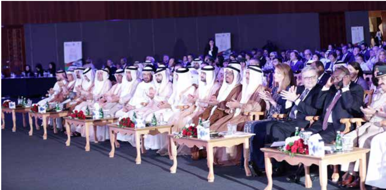
An estimated 500 delegates and participants graced the opening ceremony. Invitations were extended to senior officials within and outside the United Nations system.