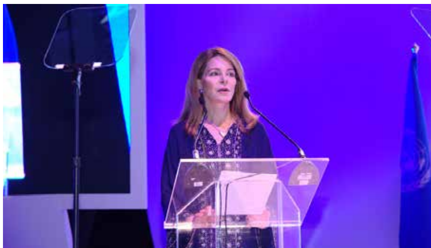
Her Majesty Queen Noor Al Hussein of Jordan delivered the keynote statement to launch the Expo.

Ban said, "Countries of the South are vital to global economic success and to the achievement of the 2030 Agenda for Sustainable Development. I welcome your decision to highlight the central role of South-South and triangular cooperation, focusing on green technology transfer, industrial innovation, and global health and food security. These cross-cutting challenges are at the heart of the SDGs. I urge you to seize this opportunity to engage, build bridges, and develop sustainable strategies together. I wish you a productive and rewarding Expo."