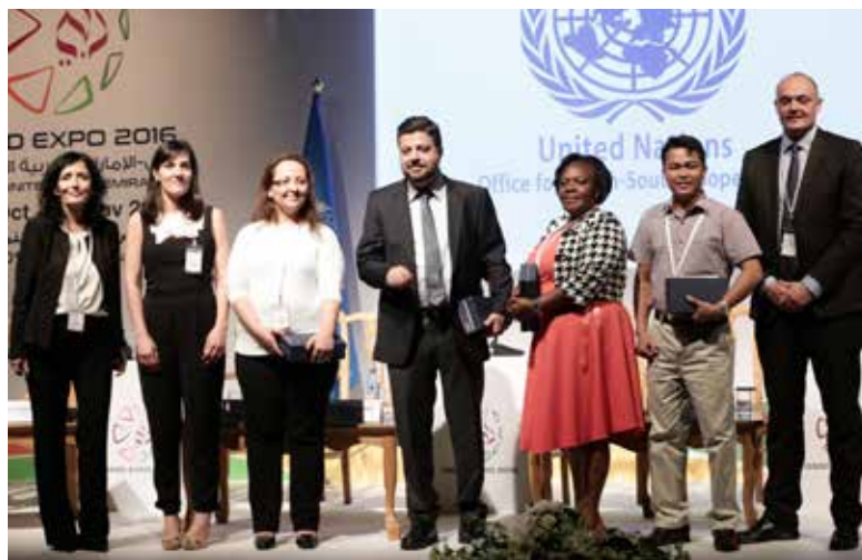
Solution Forum 2 panel

UNDP has a lot to offer in terms of its programmes and operational reach as a knowledge broker, capacity development supporter, partnership facilitator and convener. UNDP's support has grown steadily over the past years, with close to 700 UNDP projects and programmes in 2015 –double the number in 2014 – utilizing South-South and triangular cooperation as a modality across 132 countries.