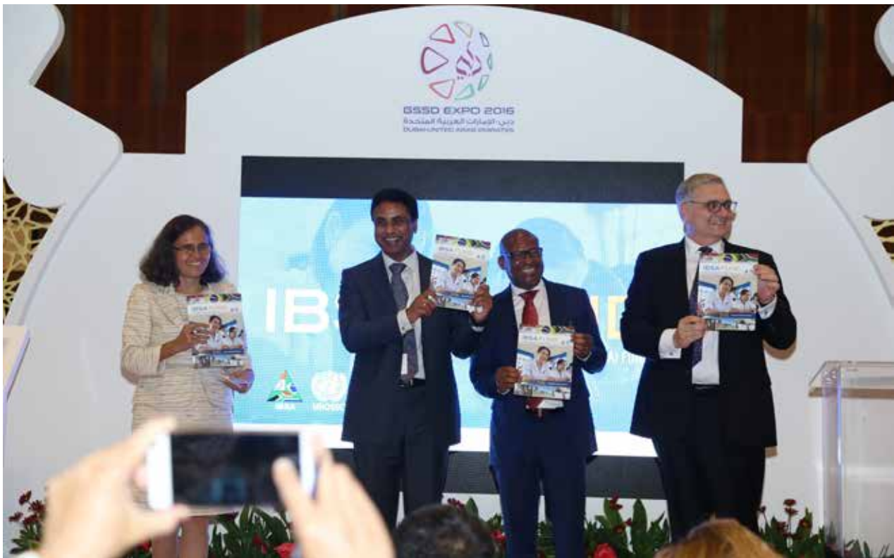
India Brazil and South Africa delegates launched the IBSA Fund report with UNOSSC.