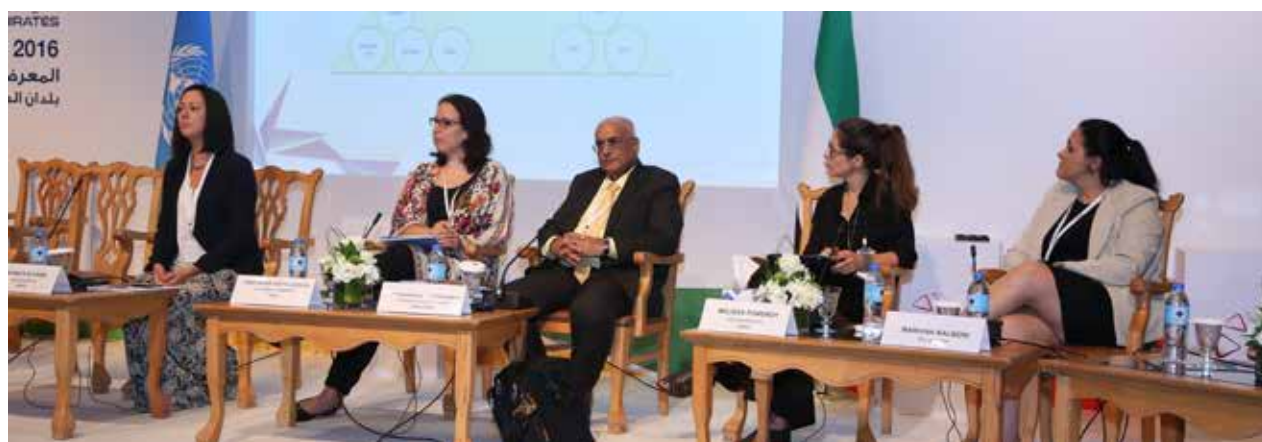
Solution Forum 11 panel discussed the findings from the research studies related to South-South cooperation.

As a follow-up to the UNDP Partnership Forum on Emerging Opportunities for Think Tanks for SSTC held at the GSSD Expo 2014, in 2015 UNDP commissioned think tanks from the South to produce analytical papers exploring the potential contribution of SSTC to the 2030 Agenda, monitoring and evaluation frameworks, and methodologies for such cooperation.