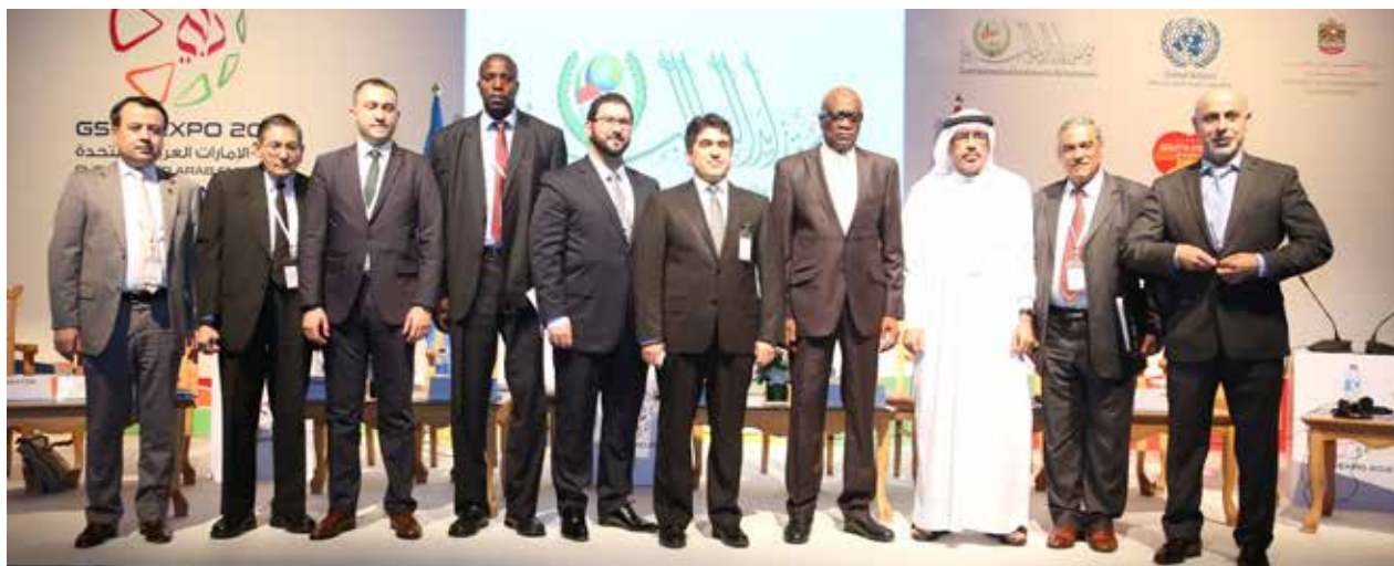
Solution Forum 7 panel of representatives from OIC institutions.

The forum focused on the Organization of Islamic Cooperation (OIC), its subsidiary organs, and specialized and affiliated institutions working with UNOSSC to achieve the SDGs in their respective fields of competence in OIC Member States. All 57 OIC Member States are in the South, so cooperation among them in the political, economic, social, humanitarian and other spheres constitutes South-South cooperation, as does the OIC's role in fostering cooperation among its Member States in pursuit of these goals. In addition to presenting their respective organizations' overall programmes, the panelists reviewed the 29 project proposals that emerged from their bilateral consultations with UNOSSC representatives at the last UN-OIC meeting on cooperation held in Geneva in May 2016, to be implemented over the ensuing two-year period, 2016-2018.