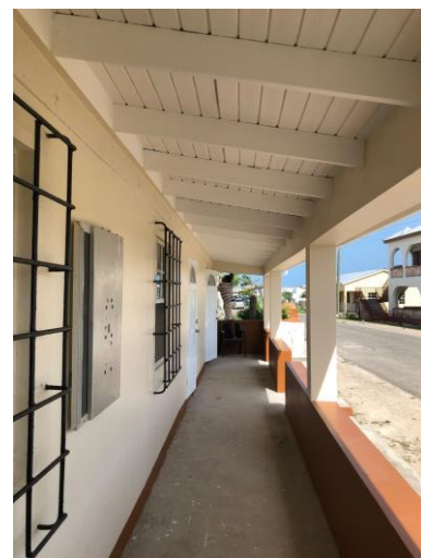
A view of the Barbuda of the Post Office Gallery

An areal view of the completed exterior works of the Barbuda Post Office