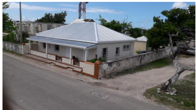
Post Office Rehabilitation:

A final session of the tender evaluation panel with participation from the Ministry of Health, Wellness and the Environment will take place during the month of July 2019. Delivery and installation of medical equipment and supplies will be aligned with the completion of rehabilitation works.