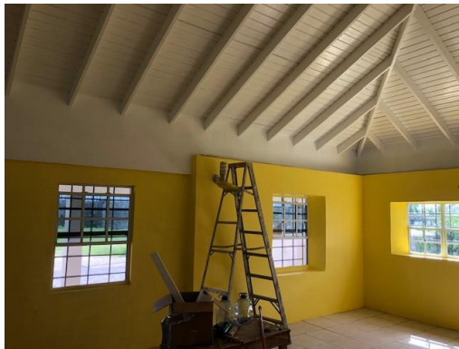
A view of the Barbuda of the Post Office Interior

The procurement process for the office equipment needed to furnish the Post Office has been completed. Delivery has been coordinated between UNDP and the Barbuda Council, with the support of the local private sector, and installation of office equipment will be aligned with the full completion of finishing works.