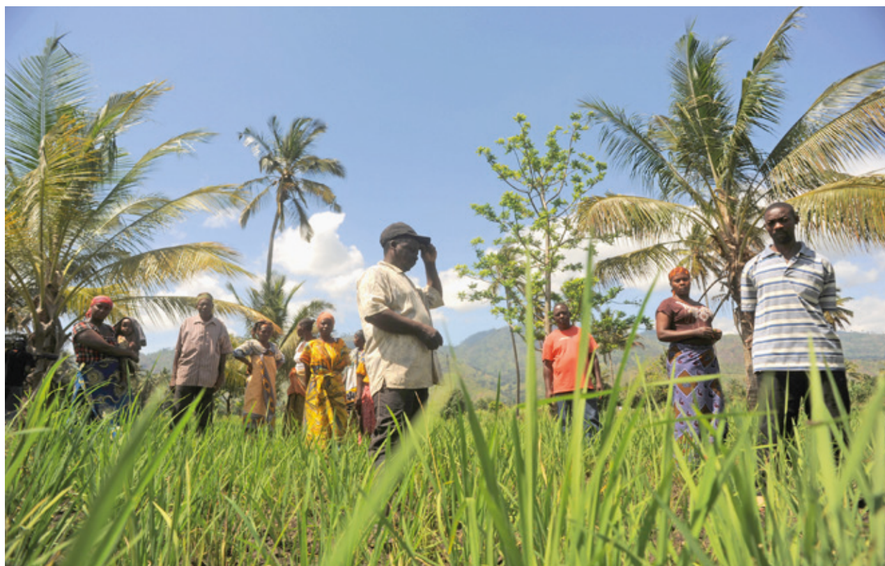
Field visit to demonstration plots for improved rice cultivation in the United Republic of Tanzania.

The first case study focuses on the work of the FAO-China South-South Cooperation Programme's work in Madagascar (UNOSSC, 2020).