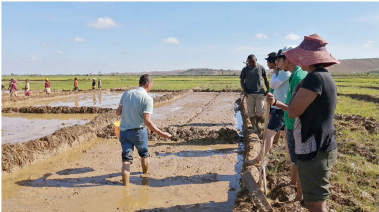
A Chinese expert dispatched by the FAO-China South-South Cooperation Programme demonstrates hybrid rice planting in Madagascar.

Constraints imposed by the COVID-19 pandemic highlighted the need for flexibility in project planning and programming and in the people engaged in the project. The rapid adoption of virtual training methods enabled much of the planned training to go ahead despite restrictions on face-to-face events, as did modification of field visits to ensure safe distancing and other measures to prevent the spread of the virus.