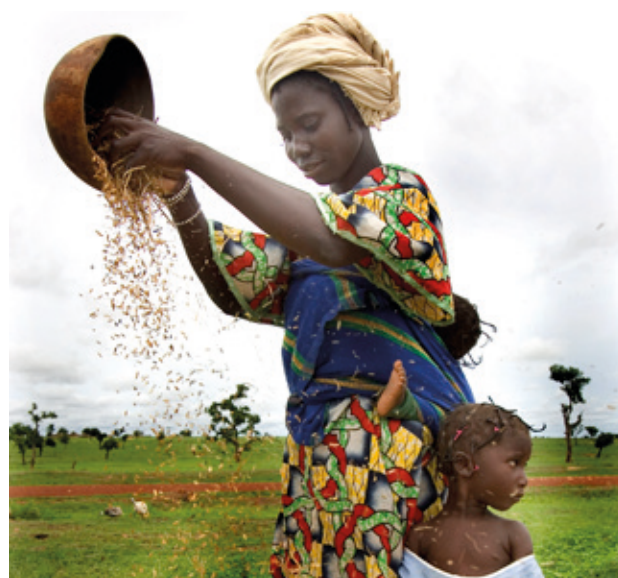
A woman winnows rice in Bagre, Burkina Faso, one of the focus countries of the project "Capacity Development and Experience Sharing for Sustainable Rice Value Chain Development through South-South Cooperation".

Lessons learned from phase I included the need for more efficient coordination of stakeholders, stronger involvement of local counterparts and training to align with country needs more closely. This is reflected in the greater emphasis on participatory studies to assess capacities and needs of key stakeholders and on strengthening the capacity of national research and training institutions in all aspects of the rice value chain, from production through to marketing and policy development and implementation, and on creating an enabling policy environment to help boost agricultural productivity and the sustainability of the countries' rice value chains.