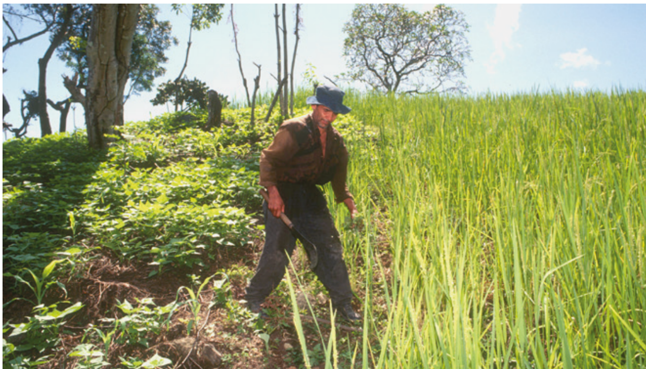
The “Mesoamerica Hunger Free AMEXCID-FAO programme” works with countries throughout the region to design, validate and support public policy instruments on food security and rural development.