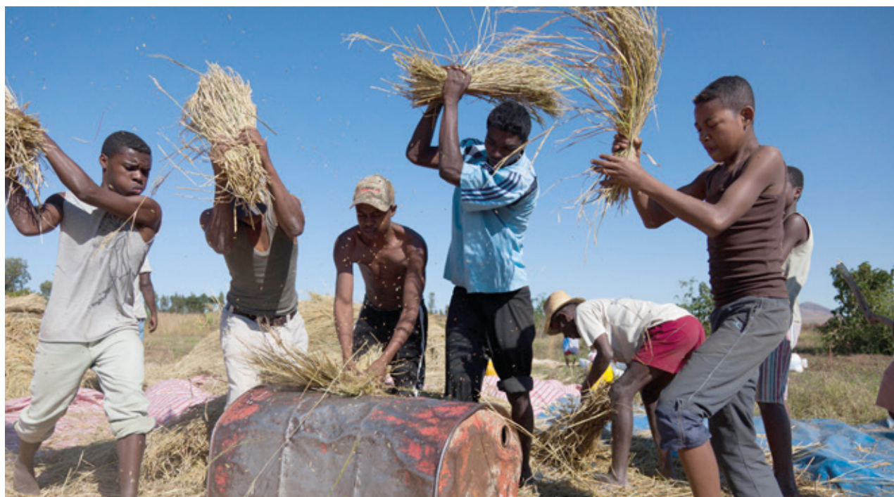
Farmers threshing rice by hand in Madagascar. The China-FAO-Madagascar South-South cooperation project is working with farmers in Madagascar to boost rice and livestock production.

The project has conducted studies of small ruminant production systems in the Diana Region, identifying problems of inbreeding and shortages of feed during the dry season as principal constraints on the system. To address these, the project has brought in improved rams and billy goats to improve the genetic make-up of the local flocks and herds and established demonstration plots. The latter have been used to introduce farmers, livestock managers and extension agents to improved forage production practices developed in China using Brachiaria grass and to conduct trials to adapt these to local conditions (FAO, 2021c).