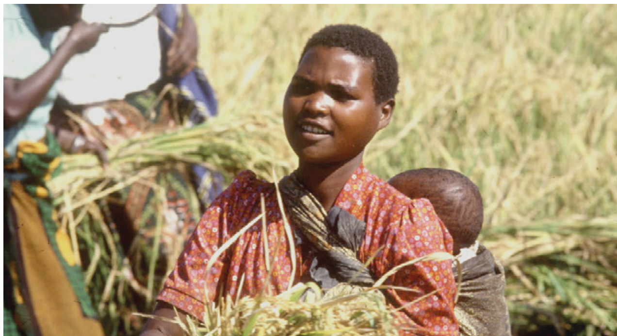
Women harvest rice using the System of Rice Intensification (SRI) method. Rice is a major staple crop in the United Republic of Tanzania, a focus country of the project “Capacity Development and Experience Sharing for Sustainable Rice Value Chain Development through South-South Cooperation.