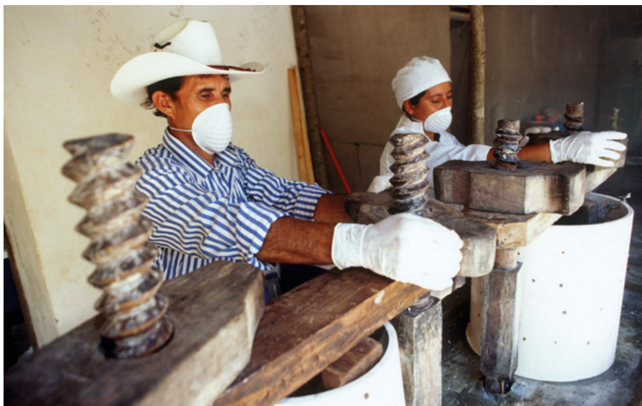
Access to safe water is fundamental to development of food industries, such as cheesemaking seen here in Honduras. The “Mesoamerica Hunger Free AMEXCID-FAO programme” works to ensure people in the region have legal protections for their right to water and sanitation.

One of the main lessons learned in formulating the model law and getting it approved by Parlantino was the crucial role of a shared vision on the intended outcome, and the need for time and space for dialogue and interaction among stakeholders to allow this to be developed.