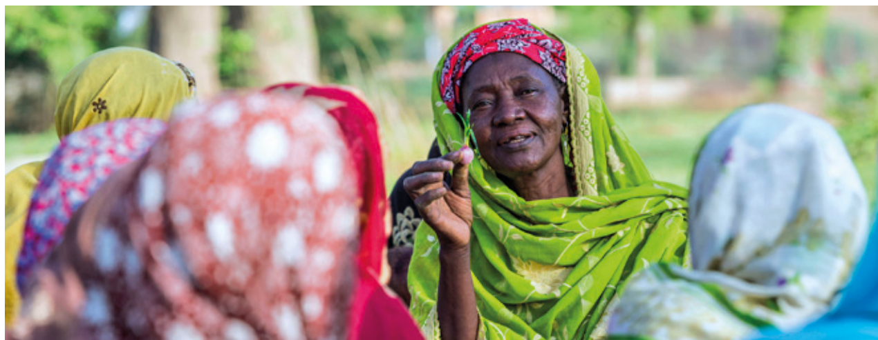
A women's group in Niger exchanges improved horticultural tips under a project supported by the African Solidarity Trust Fund.