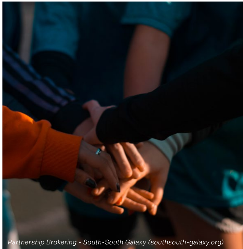
Partnership Brokering - South-South Galaxy ( southsouth-galaxy.org )

Going beyond the pandemic response, the UNSG's Report details the range of partners within and beyond the UN system that leveraged South-South and triangular cooperation to help developing countries address a wide range of needs and priorities. It noted that all five Regional Commissions have adopted South-South and triangular cooperation as their core way of working. Specialized agencies have either strengthened or mandated this form of cooperation in their activities or mode of delivery (including adopting a South-South cooperation marker in their reporting systems); and, UN Country Teams (UNCTs) have enhanced South-South cooperation efforts, although hampered by lack of dedicated capacity and resources. Think Tanks, the private sector, civil society organizations and financial institutions within and across regions have also been recognized in the Report as instrumental in catalyzing South-South and triangular cooperation, and their strategic engagement broadens the range of resources, capacities and expertise needed by developing countries across regions.