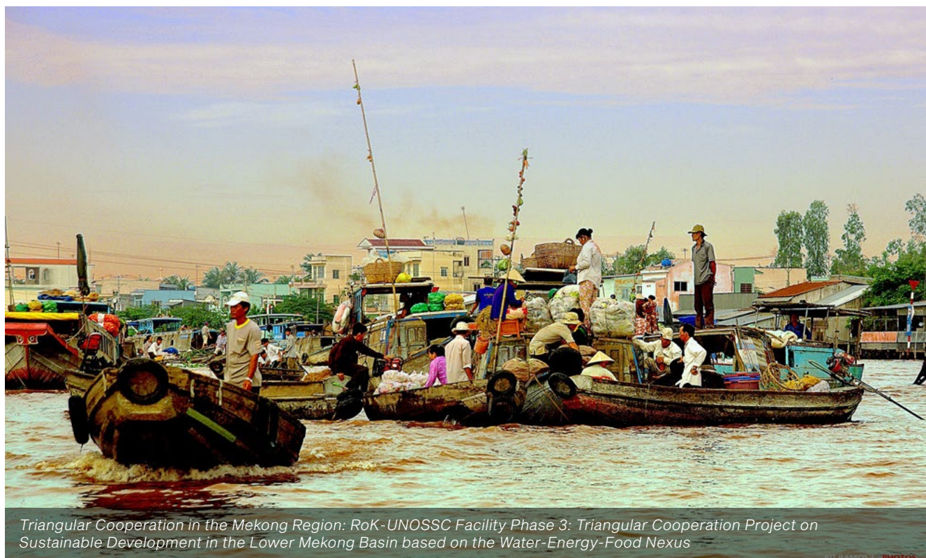
Triangular Cooperation in the Mekong Region: RoK-UNOSSC Facility Phase 3: Triangular Cooperation Project on Sustainable Development in the Lower Mekong Basin based on the Water-Energy-Food Nexus