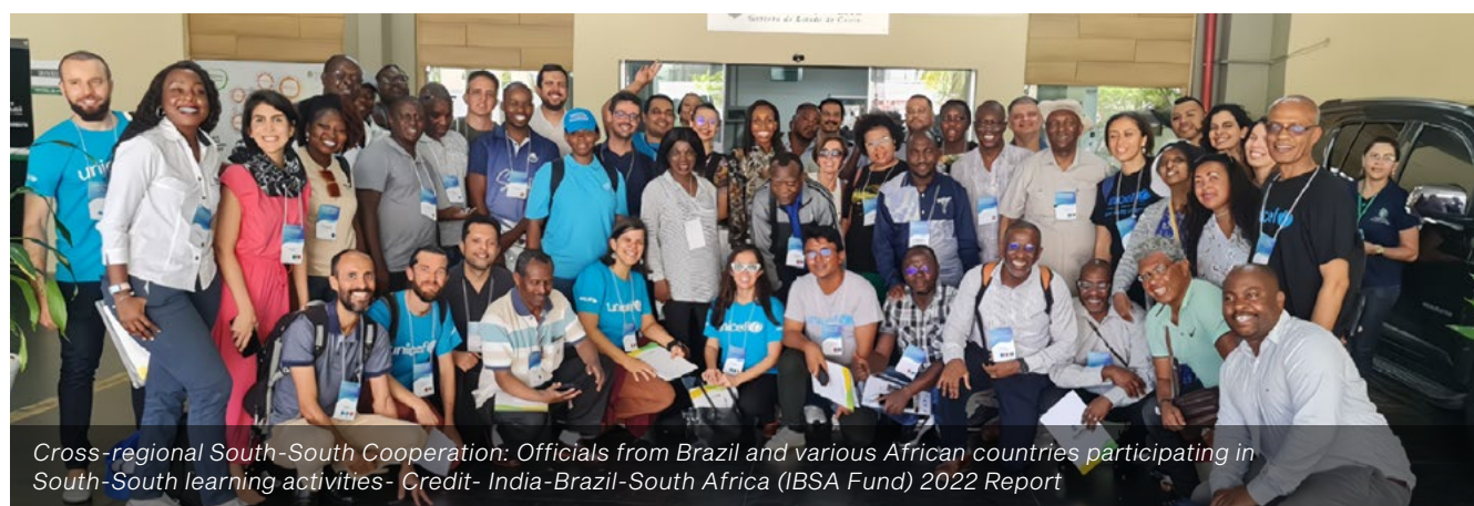
Cross-regional South-South Cooperation: Officials from Brazil and various African countries participating in South-South learning activities